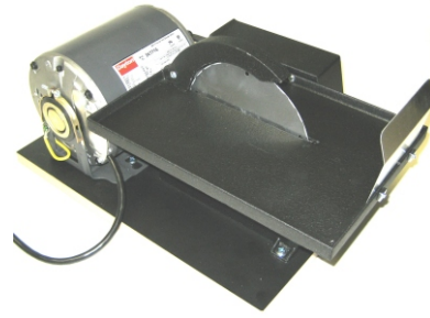
Model "JM" with Motor shown

INSTRUCTIONS: MACHINE MAY BE MOUNTED ON A TABLE, WORK BENCH OR ON A PIECE OF HEAVY PLYWOOD IF PORTABILITY IS DESIRED. FASTEN SECURELY WITH BOLTS OR SCREWS. TO INSTALL DIAMOND SAW BLADE, REMOVE HEX NUT (LEFT HAND THREAD). PLACE BLADE BETWEEN FLANGES AND TIGHTEN NUT. THE MOTOR MAY BE MOUNTED BEHIND OR BELOW THE MACHINE. WHEN USING A REGULAR BLADE, IF MOTOR IS 1725/1750 RPM , USE A 2" PULLEY ON THE MOTOR SHAFT. FOR HI-SPEED FACETERS THIN BLADE, USE A 4" PULLEY ON THE MOTOR. IF MOTOR SPEED IS 3450 RPM, USE EITHER A 1-1/2" OR 2" PULLEY FOR REGULAR AND HIGH SPEED. SMALLER DIAMETER BLADES MAY BE USED WITH A MOTOR PULLEY SIZED TO OBTAIN PROPER S.F .P .M., FOLLOW BLADE MANUFACTURES RECOMMENDATION.